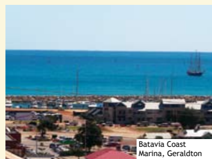
Batavia Coast Marina, Geraldton