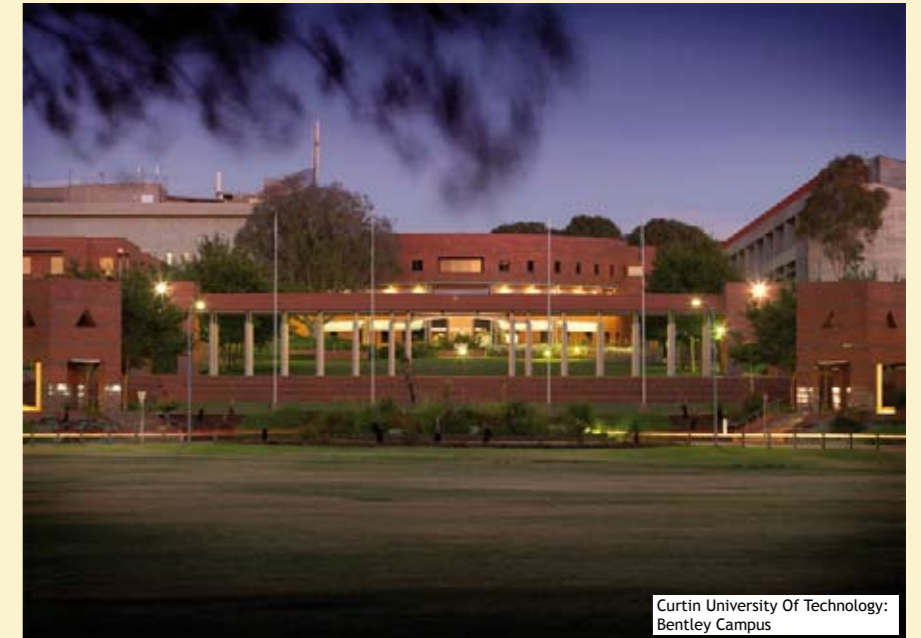
Curtin University Of Technology: Bentley Campus

Finally, and no surprise, one fifth of the females living in this area attended a University or other tertiary institution when the 2006 Census was conducted, which was five times higher than the WA figure!