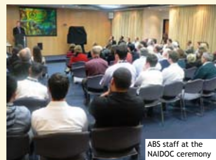
ABS staff at the NAIDOC ceremony