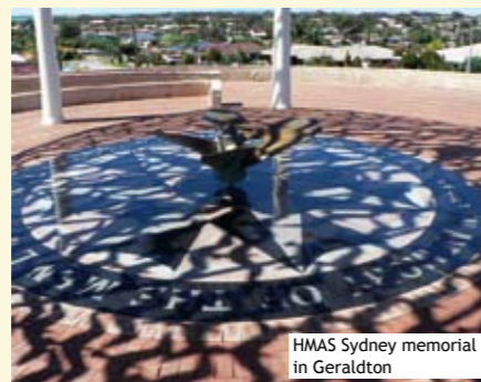
HMAS Sydney memorial in Geraldton

The first Spotlight on the Pilbara is to be launched this month, and work has commenced for both the Peel and Mid West regions. The Mid West visit provided an ideal opportunity to initiate the community consultation process and seek input into the selection of statistical indicators for the region.