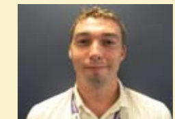
Article by: Paul Burns

So there you have it, from the figures it looks like Australia is set to trounce its old rivals. After all, the statistics don't lie.